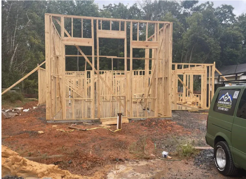
September 16, 2024