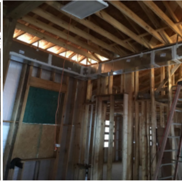
Mechanical duct and equipment are in place.