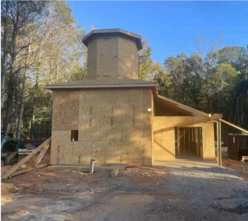
October 30, 2024