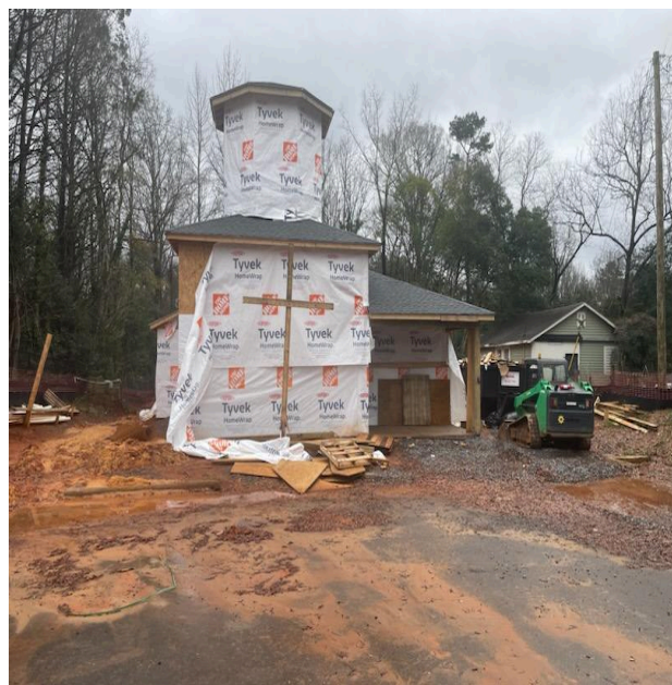
The building is waterproofed