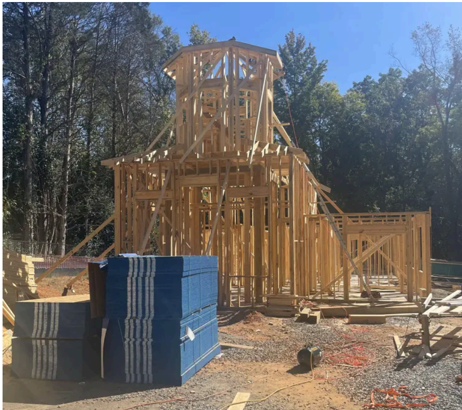
October 14, 2024