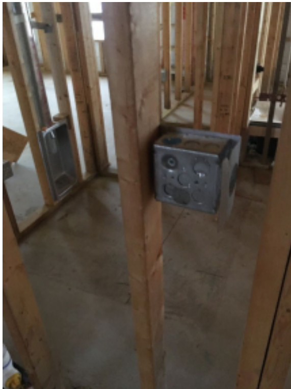
Electrical rough in has started