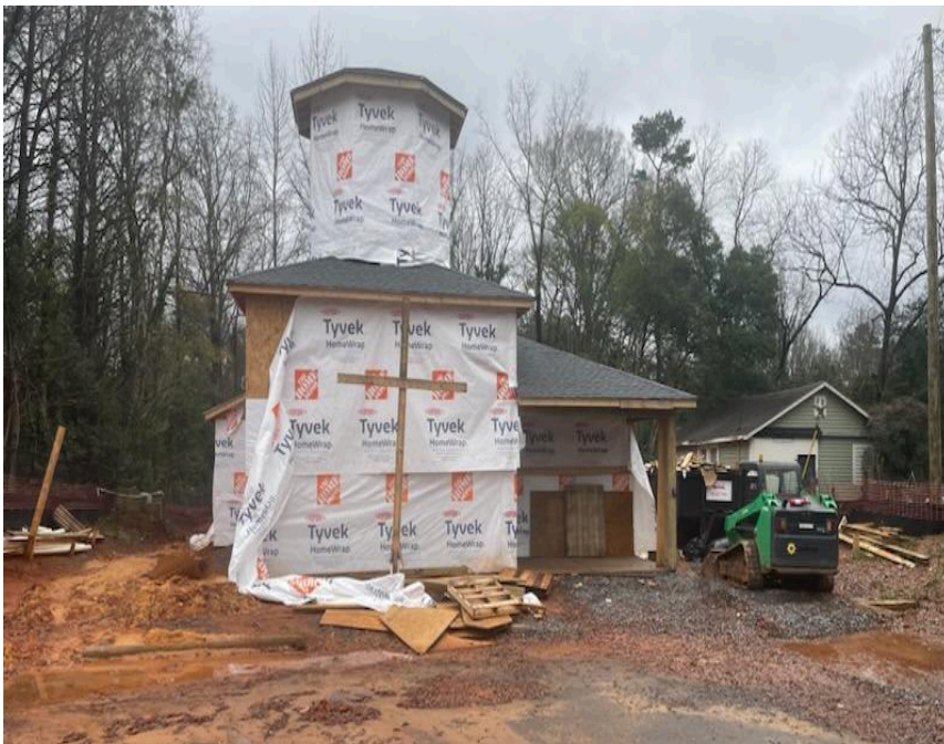
January 25, 2024