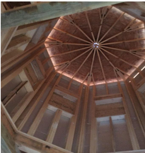
The Chapel Dome is framed and waterproofed